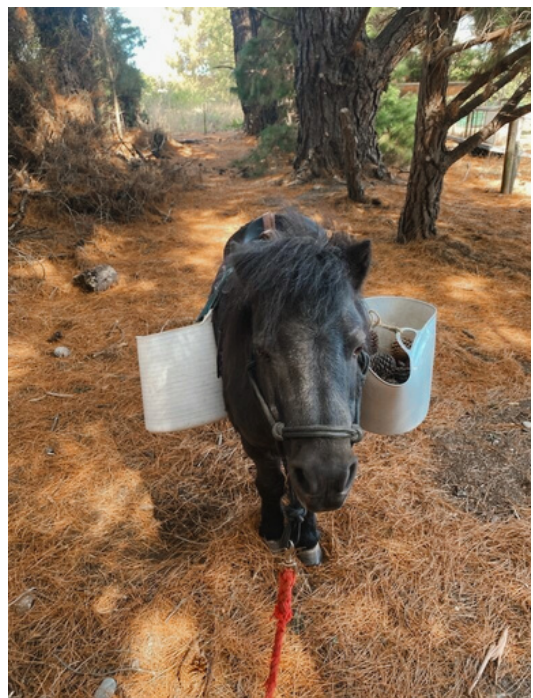
'V', Narrandera Vulcan helping collect pinecones at his happy home in Blenheim.